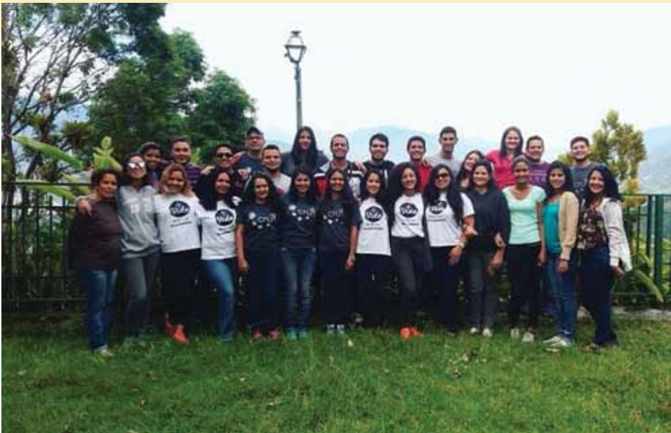
SLM Team Venezuela 2017